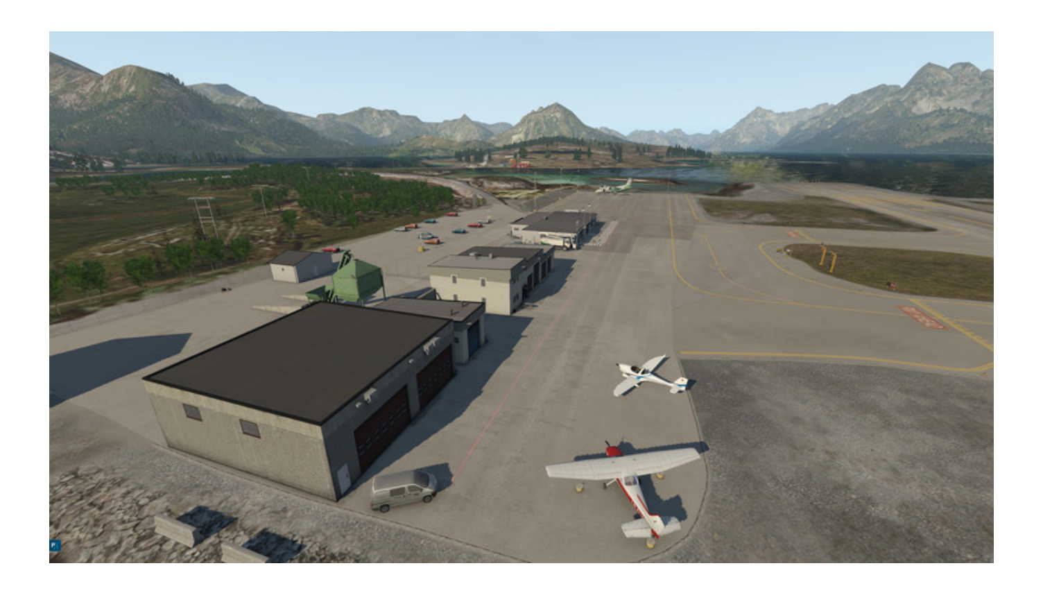
X-Plane 11 - Add-on: Aerosoft - Airport Svolvaer Full Crack